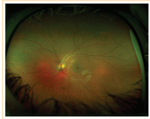
Figure 7. Retinography taken two weeks after laser treatment. The space that contained the hemorrhage persists. Folds can be seen on its surface. Vitreous cavity free of hemorrhage.

as well as inducing an epiretinal membrane and photoreceptor toxicity, with a consequent permanent VA decrease 9-11 .