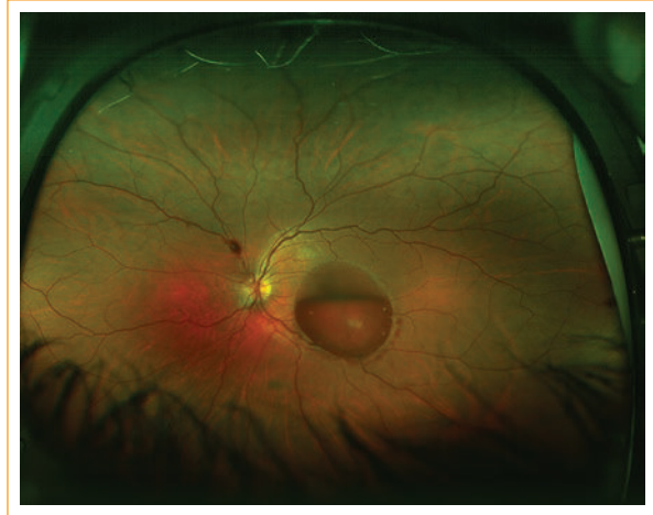
Figure 1. Sub-ILM premacular hemorrhage on the fovea and part of the inferior temporal vascular arcade. Hemorrhage area of 14 disc diameters.

The initial management was expectant, monitoring the hemorrhage while waiting for its reabsorption. Nevertheless, after 2 weeks, the hemorrhage was unchanged and without a yellow discoloration that suggests the presence of clots, and the patient did not show VA changes. After verifying that the patient did not have systemic diseases or blood dyscrasias that contraindicated the procedure, it was decided to treat him with Nd-YAG laser using a contact lens for the posterior pole. A single laser shot was applied on the posterior hyaloid and ILM, at the central point of the