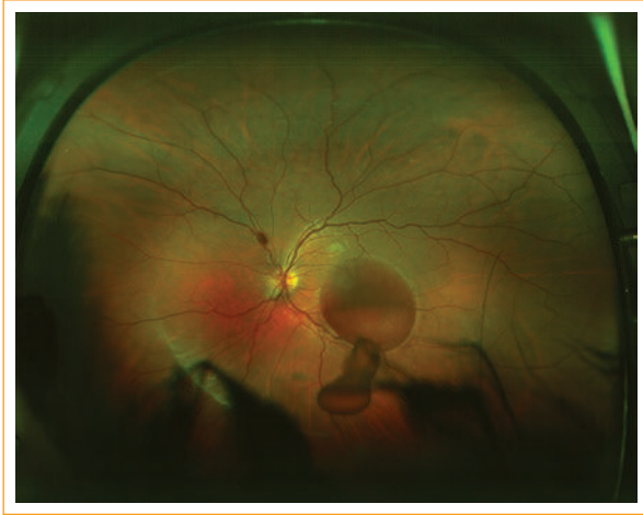
Figure 4. Nd-YAG single-shot (energy of 7.5 mJ) on the most concave point of the hemorrhagic bursa. Hemorrhage drainage is observed with persistence at the inferior level.