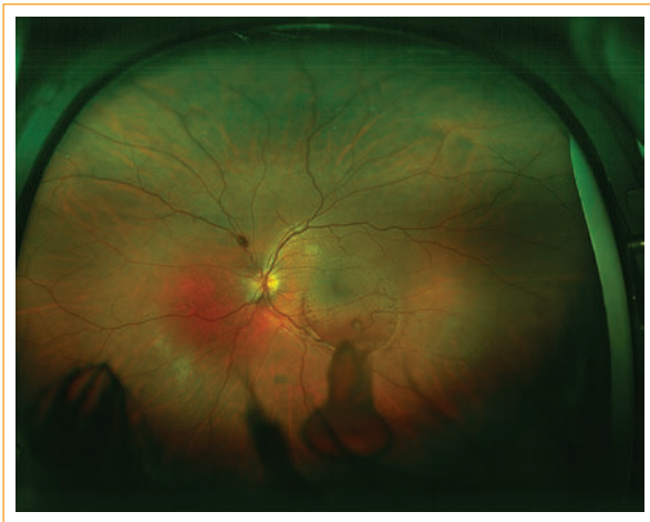
Figure 5. Drainage of the sub-ILM hemorrhage into the vitreous cavity through a single point.