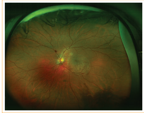
Figure 6. Premacular space without hemorrhage. Exposed fovea is observed.